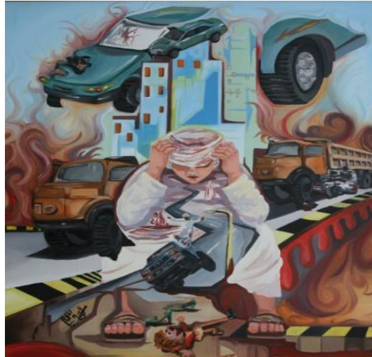
Figure 11: Painting presenting the curse of road accident, (oil on canvas), 75cm × 55cm.

In Figure 12, many signs and signals show us the damage caused by road accidents. The general composition of the painting is divided into several parts or elements. In this painting, we see women, children, cars, a wheelchair, roads, buildings, skulls and a speedometer. Student of this painting, comments: Every element in my painting has its own significance, symbolism and purpose. You can also find a variety of viewing angles; there are central, horizontal and vertical ones. I used range of colours from warm to cold. The structure of the painting is horizontal, and the extension travels up.