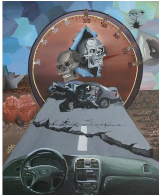
Figure 9: Representing driver as viewer with reference to causes and consequences of road accidents, (oil on canvas), 75cm × 55cm.

Painting in figure 10, deals with the damage that road accidents do to people and property. Student explains her painting by saying: “The composition in my painting divides into two horizontal sections: the bottom one represents a child (consequences), and the middle one stands for the road and car (causes). The bottom section portrays a picture of a child looking sad due to the loss of a loved one, and the car in the middle section is behind him. The purpose is to show that the car is the cause of this tragedy. A skeleton of a human hand holds a road sign that drips with blood”.