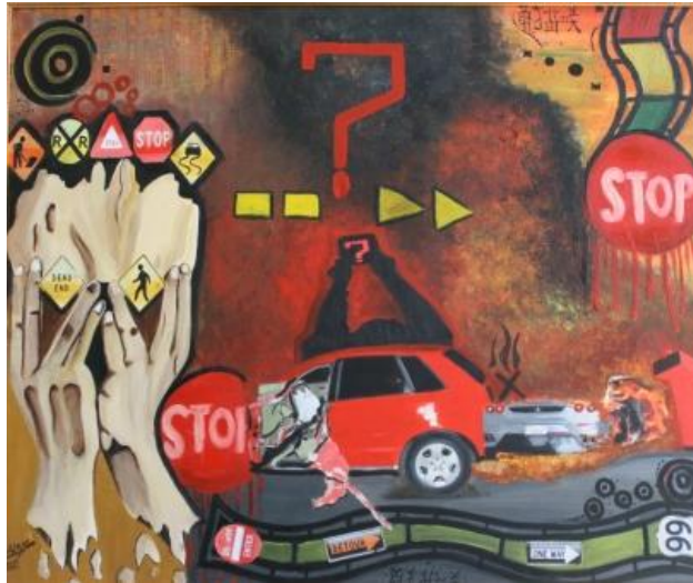
Figure 13, Symbolic way of road accidents, (oil on canvas), 75cm × 55cm.

In figure 14, student addresses the effects of accidents on people and their relatives. As student described: My painting portrays a funeral scene in which a father is seen in a graveyard showing signs of sorrow and melancholy. A 'Stop' sign is installed behind him in the top left of the work, which is one of the focal points, and the child is wrapped in clouds of smoke instead of a coffin. At the bottom of my work, there is a group of three people who have been injured in the accident that has taken the child's life. The general composition of this painting is circular, making the child and graveyard the centre of the circle in an attempt to draw the viewer's attention to the necessity of linking the two issues. The shapes present in the work are mostly curved, and the colours used are faint, engulfed by death from all sides.