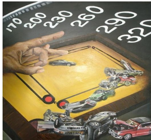
Figure 2: Painting of road accidents as a carrom game, (oil on canvas), 75cm × 55cm.

In figure 3, the painting deals with the cause of accidents and the grave consequences resulting from them. There is an hourglass, some traffic signals, a steering wheel and a speedometer. There are also written phrases, metal rods with hands behind them, roads about to collapse, and some red stains on the steering wheel. In responding to the causes of road accidents, student stated that "Speeding and non-compliance with traffic regulations are the most important causes of car accidents and my artwork highlights the cause of speeding; the hourglass aims to highlight the relationship between speed and accidents. With higher speed, the time taken for the driver to reach the final destination is shorter, but the probability of an accident is higher".