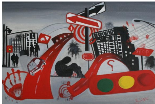
Figure 4: Silhouette of a man overwhelmed with melancholy represents a sign for controlling traffic on public roads. (oil on canvas), 75cm × 55cm.

Painting 4 has two elements (Figure 4). The first shows the immediate causes of traffic accidents, while the second reflects their catastrophic consequences. Student described her work by saying “My painting depicts roads, traffic signals and human silhouettes. It is dominated by red and black, with a small amount of grey and a complete absence of light. Also there are straight and curved lines”. Student in this painting belief in respecting the traffic signs system, she emphasised that “The traffic signals and signs are the most important tools”. Furthermore, she explains her signs by saying “The silhouette of a man overwhelmed with melancholy represents a sign for controlling on traffic public roads. The deep, dark colours are exemplified by red, which announces the approach of danger”. It can be also said that the black colour represents sorrow and condolence. Furthermore, there is a complete absence of white in this work.