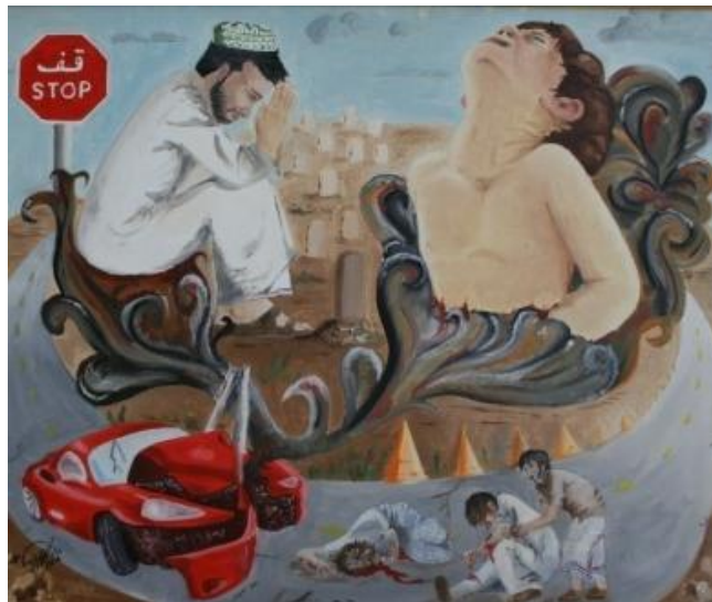
Figure 14: Shown the effects of accidents on people and their relatives, (oil on canvas), 75cm × 55cm.

In figure 14, student addresses the effects of accidents on people and their relatives. As student described: My painting portrays a funeral scene in which a father is seen in a graveyard showing signs of sorrow and melancholy. A 'Stop' sign is installed behind him in the top left of the work, which is one of the focal points, and the child is wrapped in clouds of smoke instead of a coffin. At the bottom of my work, there is a group of three people who have been injured in the accident that has taken the child's life. The general composition of this painting is circular, making the child and graveyard the centre of the circle in an attempt to draw the viewer's attention to the necessity of linking the two issues. The shapes present in the work are mostly curved, and the colours used are faint, engulfed by death from all sides.