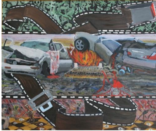
Figure 7: Painting of accident three in one, (oil on canvas), 75cm × 55cm.

In Figure 8, the painting deals with the causes of road accidents and the damage they do to people and property. Student described his painting as: “complex work and can be divided into several sections; some representing the causes of accidents, and others addressing the resulting effects. The colours used are of great importance. They have distinctive symbolism: red symbolizes danger, and black symbolizes sorrow in general and death in particular”.