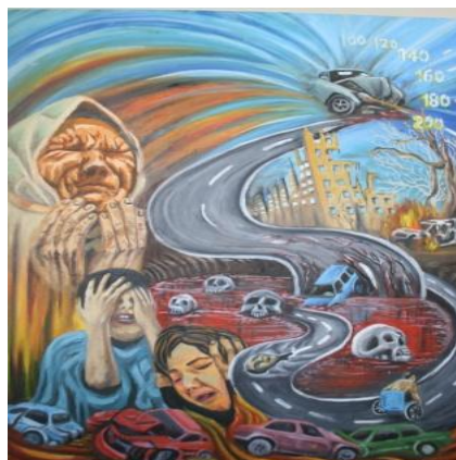
Figure 12: Speeding is the leading cause of road accidents, (oil on canvas), 75cm × 55cm.

In this painting, we see a weeping woman placing her hands over her face, crying over the loss of a loved one and looking dejected and sad. Two children are also crying over the loss. This student explains her symbols furthermore by saying “The elements reminding us of the fallout from accidents are the human skulls, which lead to the context of the death. The viewers can also find a person using a wheelchair, which shows the harm that road accidents inflict on those involved”. Reflecting on the student’s statements and the composition of her painting, the researchers also sees the elements that represent the causes of these accidents are the cars and speedometer, since speeding is the leading cause of road accidents.