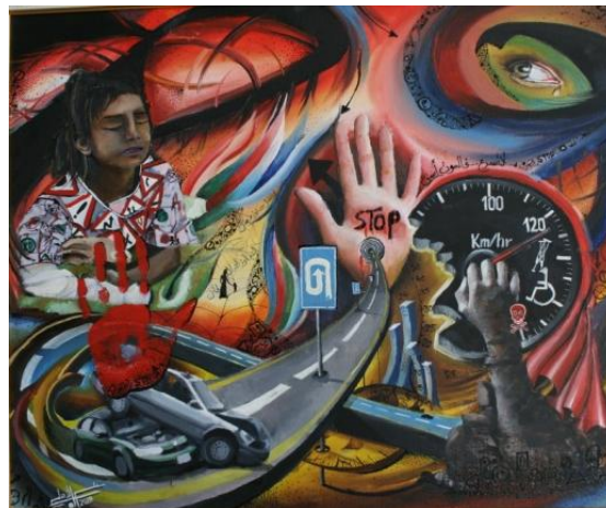
Figure 6: symbols of causes and consequences of road accidents, (oil on canvas), 75cm × 55cm.

The composition of painting (Figure 7) can be divided into three parts. Student in this painting calmed that “One depicts the result of a car accident, and the other two address the causes. The colours used are mostly dull and washed out, suggesting grief. The lines are sharp, and simple geometrical shapes are used”. It can be said also, the level of light is low and has no definite source. Moreover, this student emphasised that “The content of middle panel in my painting implies the effects of not wearing a seat-belt. Also, in the middle of the road there are cars that have been damaged in an accident and blood is strongly represented”.