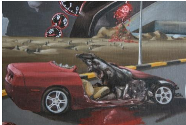
Figure 8: Painting of speedometer stained with blood symbolizing speeding, (oil on canvas), 75cm × 55cm.

The painting in figure 9 has a pyramidal composition. This places great importance on the background. The student has concentrated on creating perspective by using the lines of the road, which draw the viewer's eyes to the focal point and the work's visual interest: the speedometer that the driver is heading toward. This was supported by student when she said “My painting places the viewer in the position of the driver. From this perspective, the viewer can see some human skulls emerging from the speedometer, and two damaged cars in front of it, on a road that has been torn apart”. All these elements signify the danger of driving too fast on public roads and draw attention to follow the traffic system with respect and dignity.