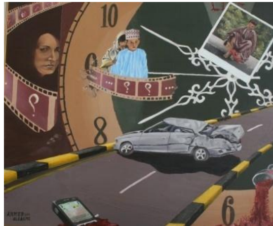
Figure 15: showing deep memories of road accidents and sadness, (oil on canvas), 75cm × 55cm.

Figure 16 shows the tragic outcome of a traffic accident due to the use of a mobile phone too. Student emphasised the consequences of road accidents by saying "The result is a road stained with blood, suggesting the disappearance of people and the shock of hearing the news. I represented the family's memories by a family photograph, are scattered on the road". The presence of the photograph also suggests that family was the driver's most important priority.