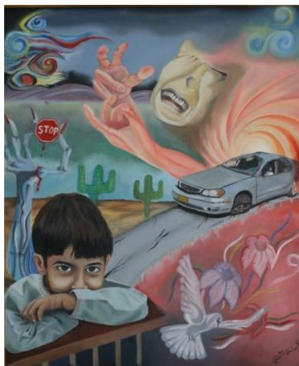
Figure 10: visible and invisible damages of road accidents, (oil on canvas), 75cm × 55cm.

The composition of painting (Figure 11) is vertical and the elements are distributed from bottom to top in the shape of a pyramid. The elements that consist the painting are roads, cars, buildings and a child. Juxtaposition and paradox are represented by the cold and warm colour tones.