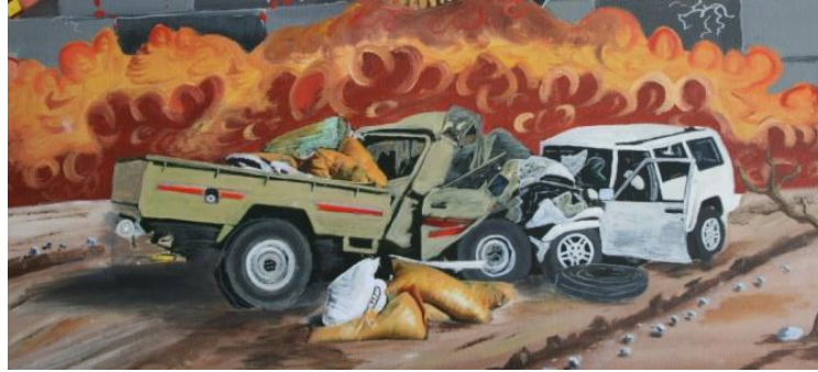
Figure 5: Painting face to face accident, (oil on canvas), 75cm × 55cm.

In Figure 6, there are several components: damaged cars, cars driving on roads, speedometers and traffic signals. We also find an incarnation of faces and hands. There are several landscapes in this painting. The work is painted in dark, deep colours. Red signifies danger and fear. Black and grey signify sorrow, and again there is a complete absence of white. Student described her painting by saying: “In my painting, you can see shapes and most of them are curved or bent to signify speed and the indifference of road users to traffic rules. Also in the top left-hand corner of the work a young boy is showing signs of sorrow, due to the loss of a relative or a loved one. On the top right of the painting is a weeping eye, enveloped in the painting’s background, which is dominated by black and red. At the centre is a palm held up displaying the English word ‘Stop’, signifying disregard for the traffic rules”.