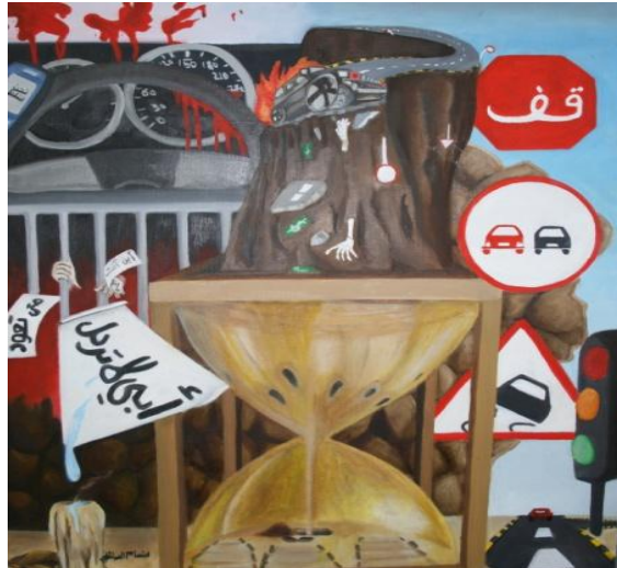
Figure 3: Painting includes several signals symbolizing of the car accidents, (oil on canvas), 75cm × 55cm.

Painting 4 has two elements (Figure 4). The first shows the immediate causes of traffic accidents, while the second reflects their catastrophic consequences. Student described her work by saying “My painting depicts roads, traffic signals and human silhouettes. It is dominated by red and black, with a small amount of grey and a complete absence of light. Also there are straight and curved lines”. Student in this painting belief in respecting the traffic signs system, she emphasised that “The traffic signals and signs are the most important tools”. Furthermore, she explains her signs by saying “The silhouette of a man overwhelmed with melancholy represents a sign for controlling on traffic public roads. The deep, dark colours are exemplified by red, which announces the approach of danger”. It can be also said that the black colour represents sorrow and condolence. Furthermore, there is a complete absence of white in this work.