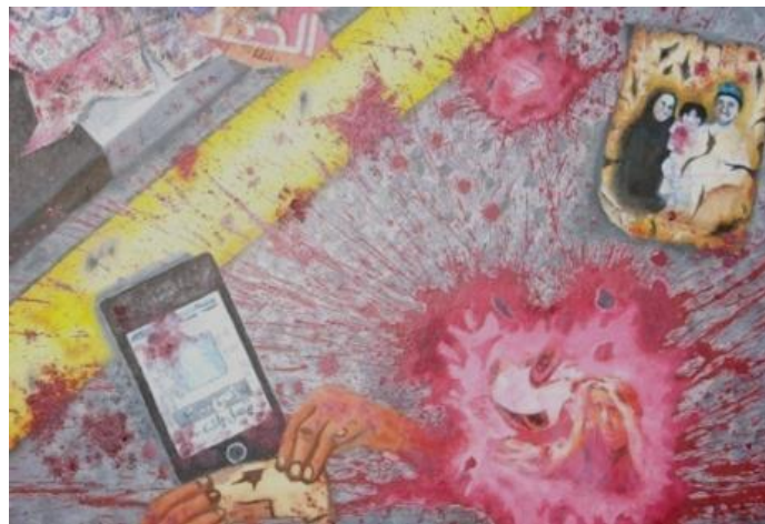
Figure 16: presenting family's memories in references to road accidents, (oil on canvas), 75cm × 55cm.

Finally, from the students' paintings and students' interpretations of these paintings, we categorized that primary causes of road accidents in Oman appear to be a result of driver behaviour, for example, not using seat-belts, speeding, using mobile phones, sending text messages, adjusting the radio or the CD player.