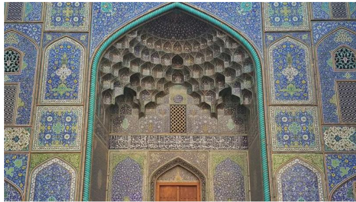
Figure 4 An example of using Arabic calligraphy and Islamic decoration in Architecture.