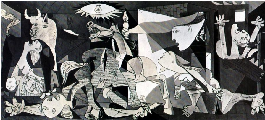
Figure 5 The Cubist School - Guernica (1937), by the Spanish artist Pablo Picasso