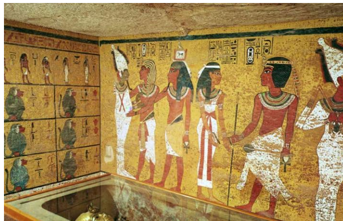
Figure 2 A mural painting, ancient Egyptian civilization - Tutankhamun's Tomb, Luxor, Egypt

From the above discussion, it is evident that "Creed" is the main approach to comprehending the fine arts and the key source of artworks' subjects' inspiration in the successive human civilizations. While unique aesthetic artistic solutions and appropriate techniques were developed to express these subjects affected by the geographic, economic, and technologic development of each civilization. The following three examples from Figure 1, Figure 2, and Figure 3 show examples of artworks produced in the ancient Egyptian, Christian and Coptic civilizations which are a clear reflection of the idea of the faith influence on drawn and represented subjects expressing these stages.