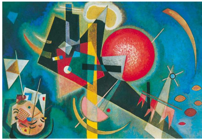
Figure 6 Abstract school model - In the blue 1925, by the Russian artist Wassily Kandinsky