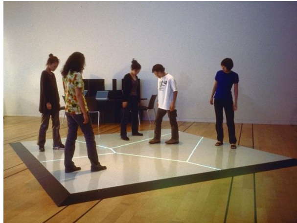
Figure 8 Interactive art...work titled "Frontier Quests" (1998) by Scott Snippy at the NTT Communication Center in Tokyo

Conceptual art was presented by the American conceptual artist Joseph Kosuth, who found that the interactive art technique based on using modern technology such as photography and video art would assist in achieving added value to the artwork. The receiver can interact with the artwork dynamically and not just emotionally. The following examples presented in figures 8 and 9 represent contemporary artistic trends (Postmodern art).