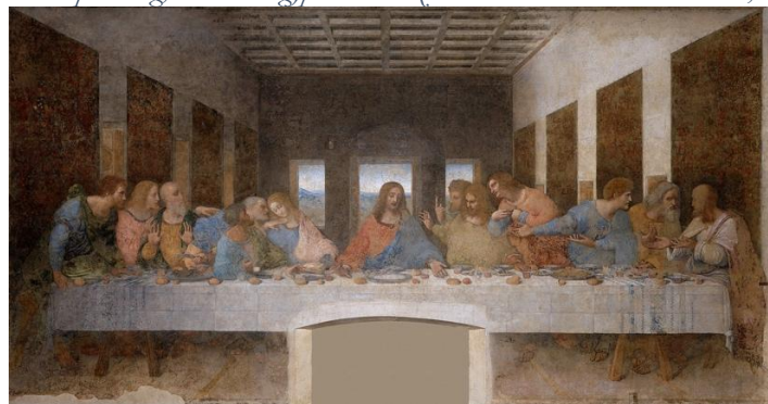
Figure 3 Mural painting (The Last Supper) - by the Italian artist Leonardo da Vinci - Italian Renaissance