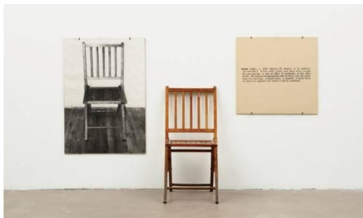
Figure 9 Conceptual Art ... Joseph Kosuth, A Chair and Three Chairs, 1965, Museum of Modern Art, New York